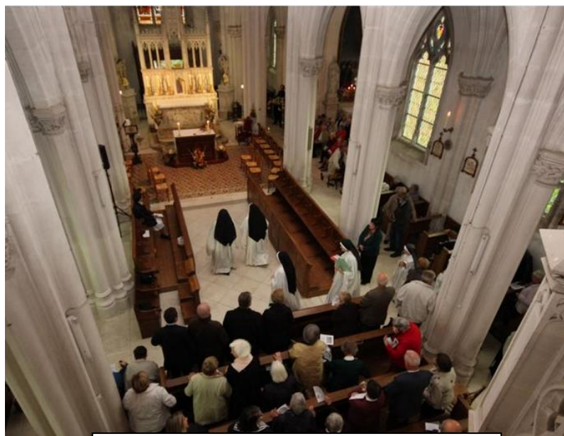
Inaugural Mass - 29 September 2013

3 rue du Couvent, 52210, Saint Loup sur Aujon, France.